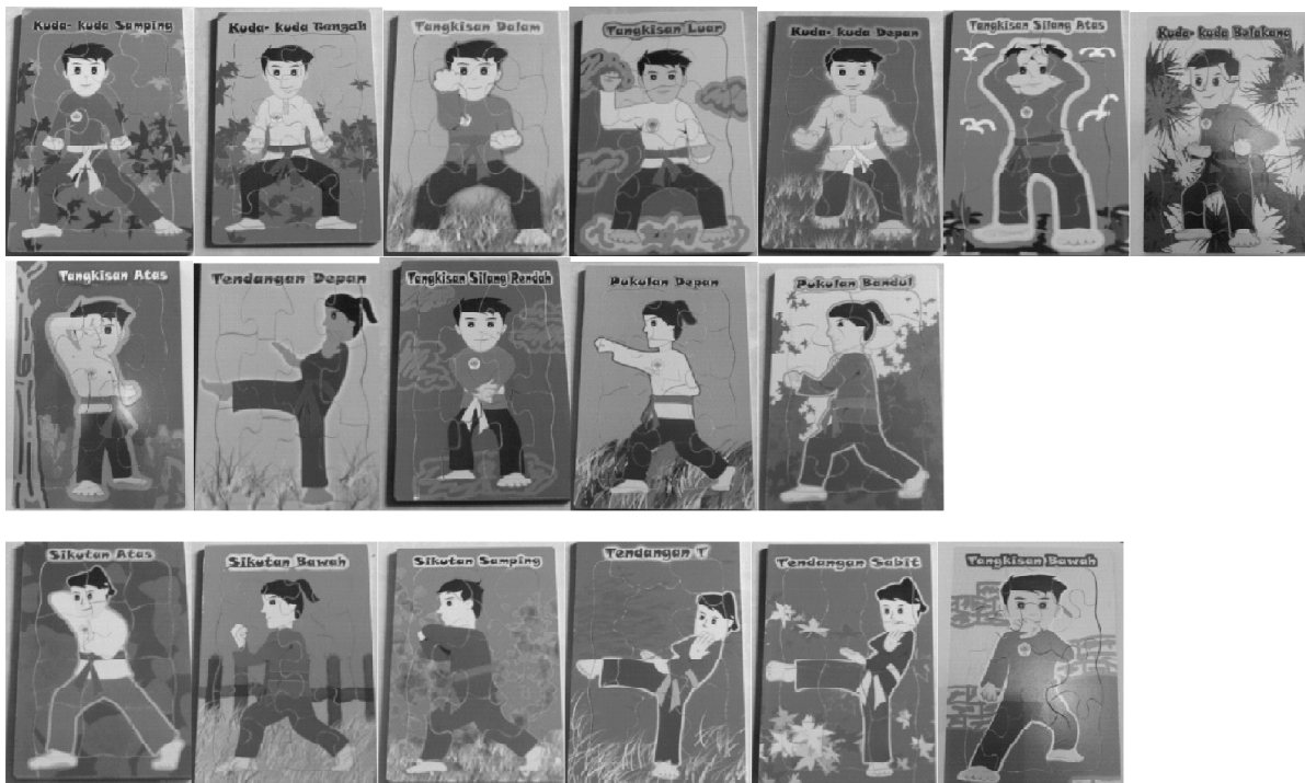
Picture. Puzzle display and coloring book After Final Revision